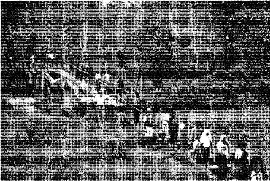
On the Waidoi Rubber Plantation. The women are carrying latex, drawn from the trees, to be treated and turned into sheets of pure India-rubber for export.