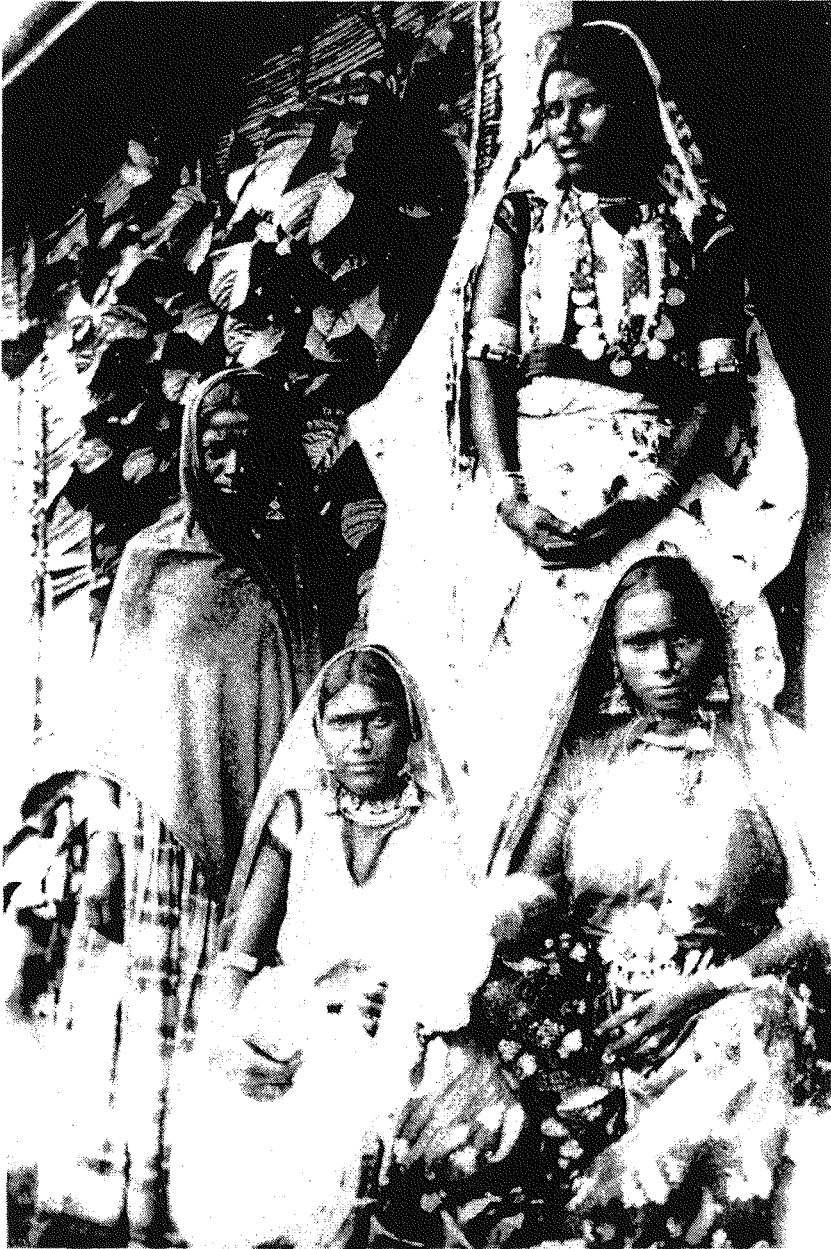
Girmitya women in traditional finery. Note the necklace of gold coins ( mohur ) worn by the woman standing on the right. Mohur was the most prized ornament among women.